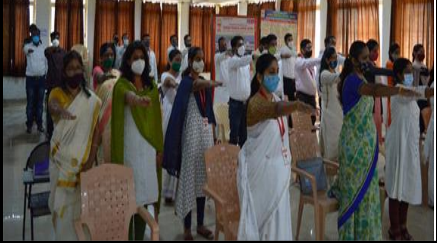
Fig. National Unity Day