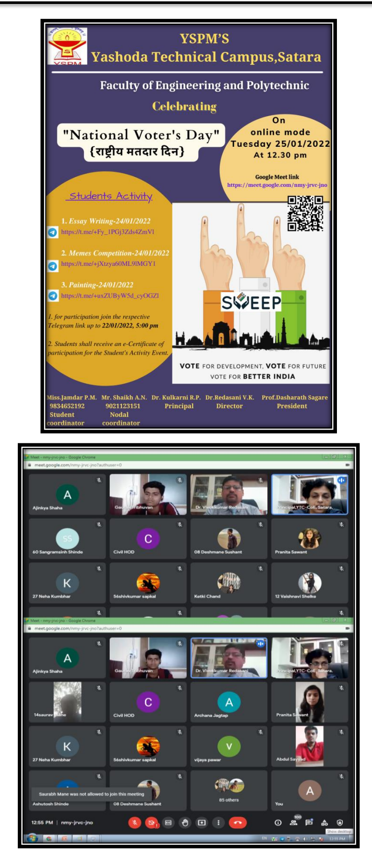
Fig. National Voters Day