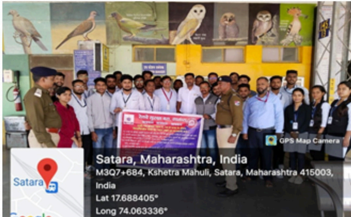
Visit to Satara Railway Station, Satara