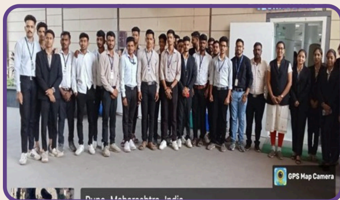
Industrial Visit at PHN Technologies Pvt. Ltd. on 14/03/2024