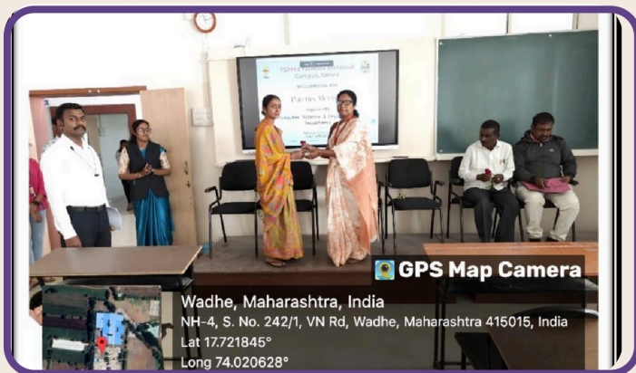
Parents Meet in CSE Dept (28/10/2023)