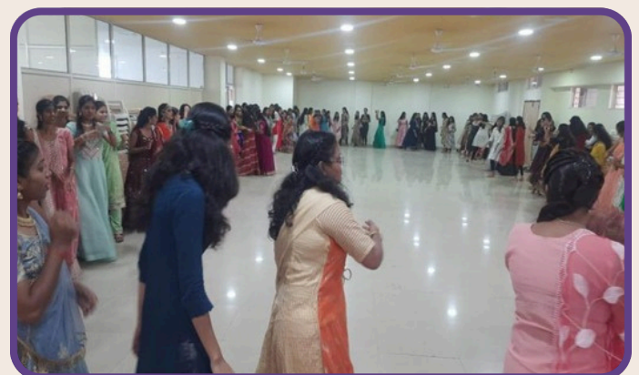
Dandiya Celebration (25/10/2023)