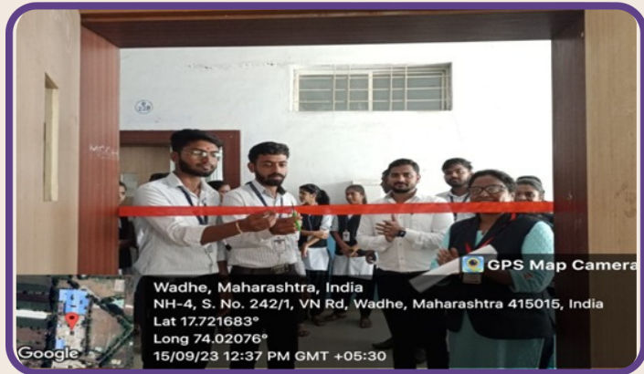
Engineers Day-ICT classroom and ML lab inauguration (15/09/2023)